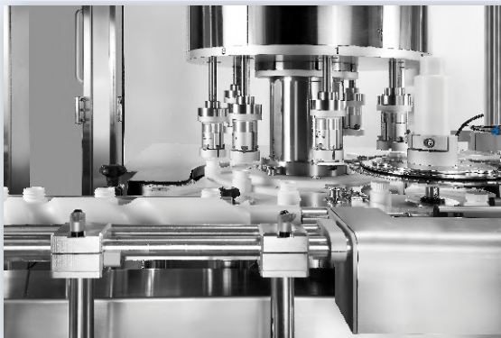
• Capping Turret