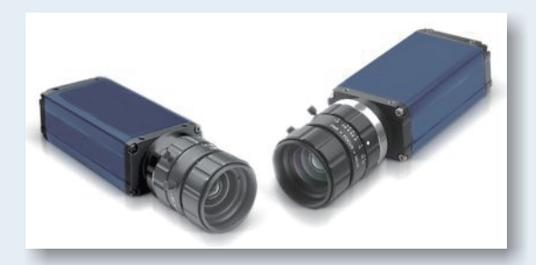
VISION INSPECTION SYSTEMS